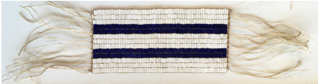
Figure 1. Two-Row Wampum Belt

article explicitly privileges Indigenous ways of knowing through telling stories in a two-row visual code. It is intended to brighten our minds.