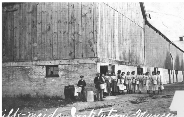
FIGURE 1 Children with milk buckets at Mount Elgin (1909).